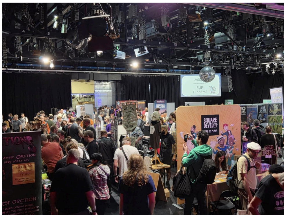
Norwich Games Convention 2025 @ Epic Studios, Norwich

This pack includes what you need to know about this year's convention, from stand options to sponsorship opportunities. We can't wait to see what everybody brings to NGC 2026 - let's make it a magical event!